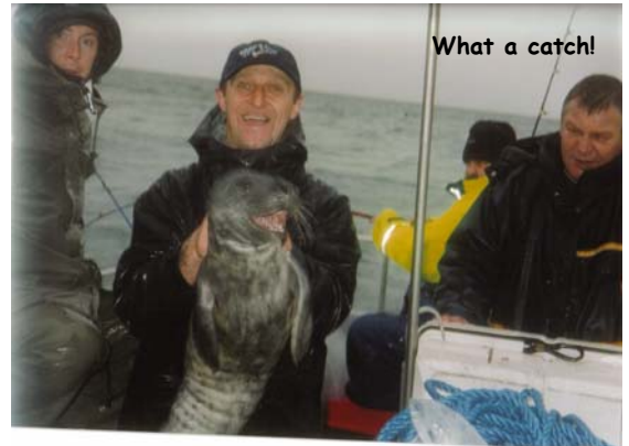
What a catch!