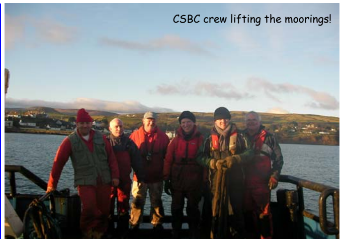
CSBC crew lifting the moorings!

Plans are afoot to paint the outside of the Club and to build a glass porch inside the front lobby. Some work is also needed in the changing rooms and showers. Look out for calls for volunteers for work parties!