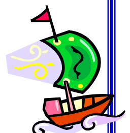
A stormy day on Gighal

The Club has agreed that the 'green' can still be used as amenity land by visitors so it will not be fenced. However, CSBC will be responsible for grass cutting and general maintenance! Any volunteers!!!!