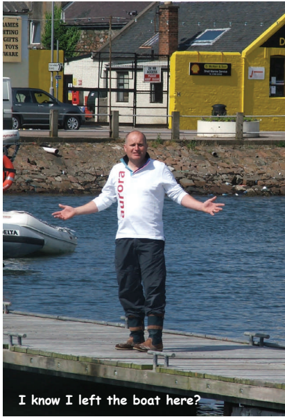
I know I left the boat here?